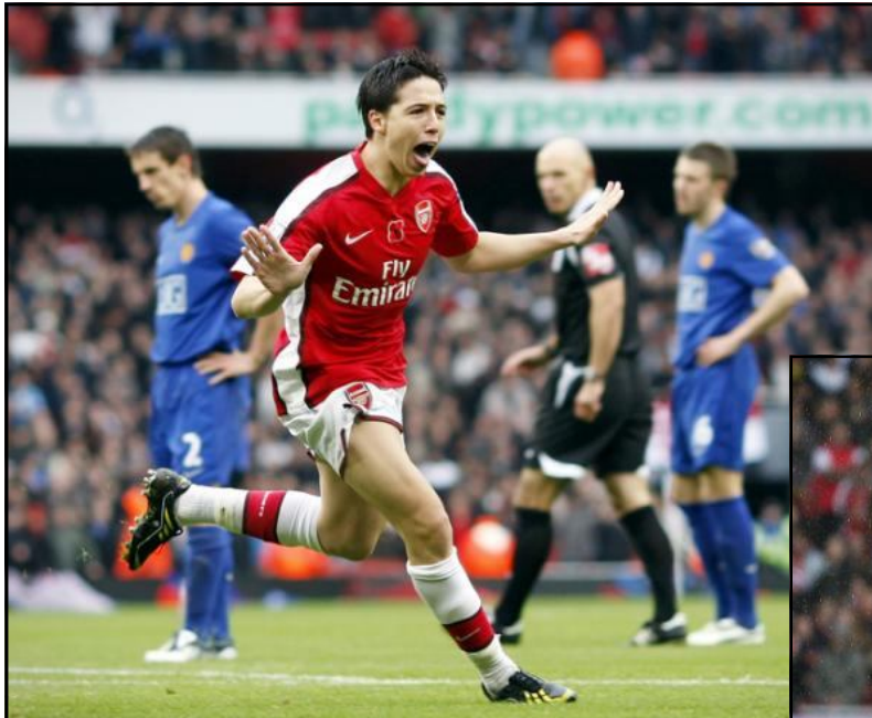
Samir Nasri celebrates the second of his two goals against United.